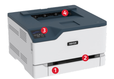
Xerox® C230 Colour Printer