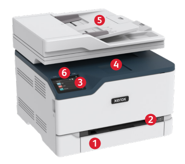
Xerox® C235 Colour Multifunction Printer